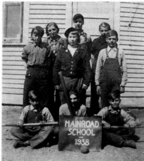
Mainroad School, 1938.